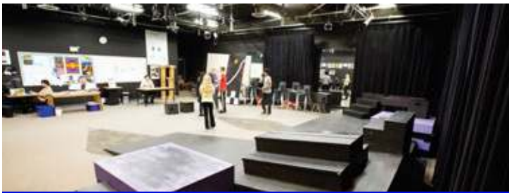
Performing Arts Theatre