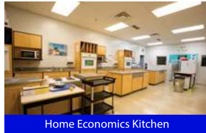
Home Economics Kitchen